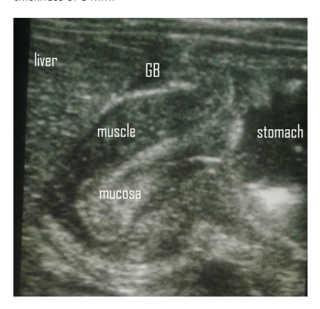
Figure 1: Trans-abdominal ultrasound with high frequency linear probe: Abnormally thick walled, peripherally hypo-echoic and centrally hyperechoic tubular structure just inferior to the gall bladder (GB) proximally continued to the dilated stomach.

The length of this abnormal segment is 24 mm with a wall thickness of 8 mm.